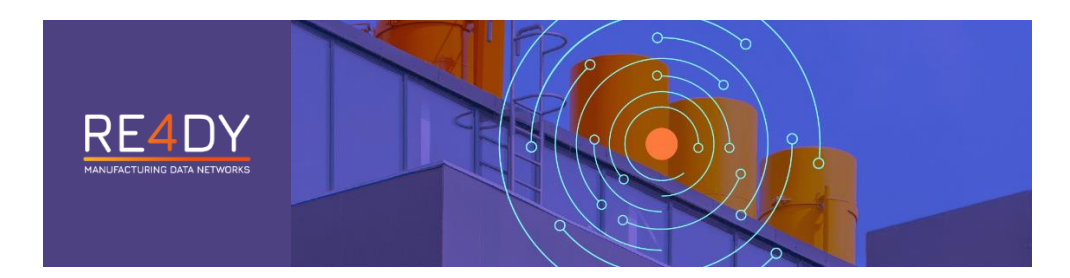
Figure 8 Twitter Avatar and Header

The objective of twitter is to generate as much engagement as possible through likes, retweets, replies, profile links, etc. It aims to create a dynamic and fast-moving environment for target audience to always stay up to the trend of RE4DY activities and industry 4.0.