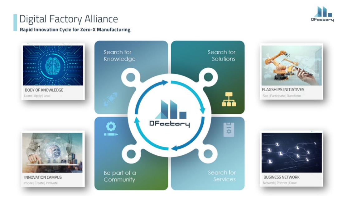
Figure 2 DFA main pillars