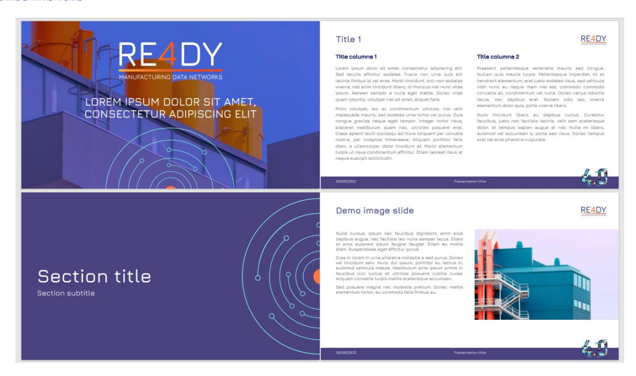
Figure 4 RE4DY PPT template