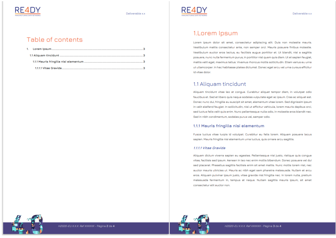
Figure 5 RE4DY Word template