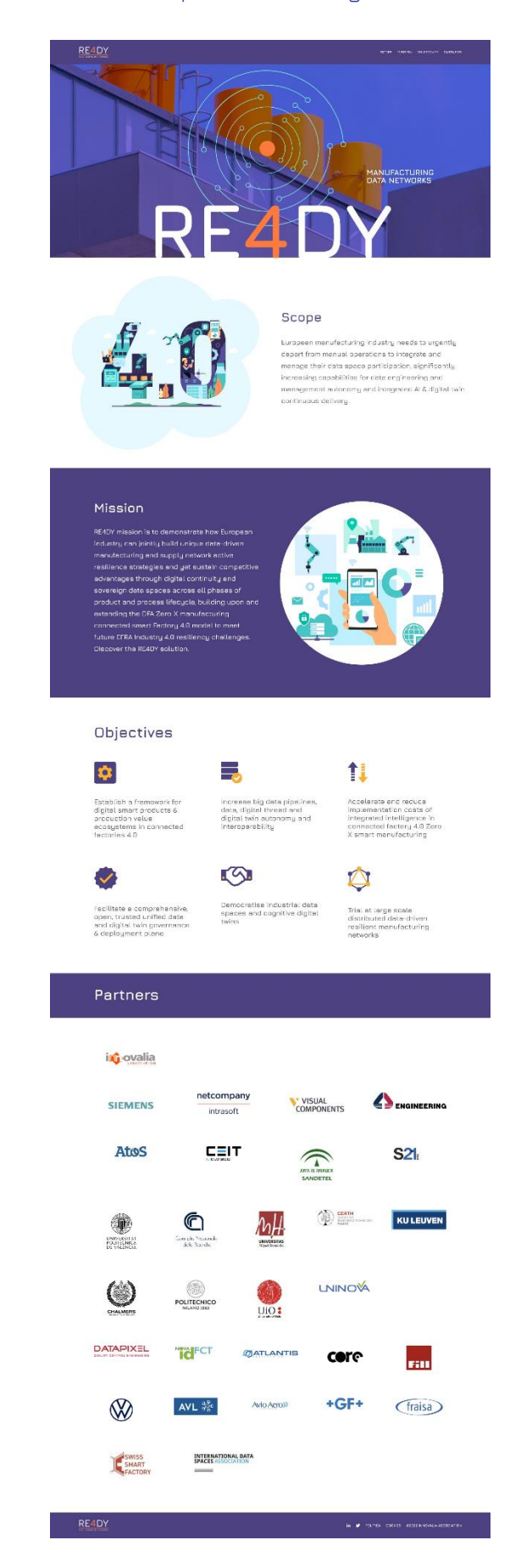
Figure 7 RE4DY website